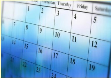
Save the date!

Due to increased demand, ACTS Leadership Workshops will be held bi-monthly beginning in February 2011. All workshops will be held at the Basilica Auditorium. Online registration is encouraged at www.rgvacts.org . The $20 fee for the full day event includes workshop materials, a light breakfast, and lunch. Registration may be paid online using Paypal or on site.