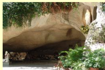
Oblate School of Theology Grotto